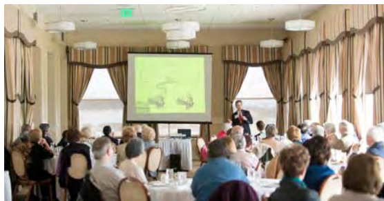
Examples of Successful Planned Giving Cultivation & Stewardship Events