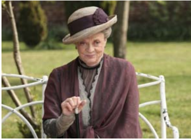
Dowager Countess of Grantham's Guide to Stewarding Legacy Donors