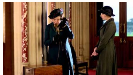
Keep in Touch